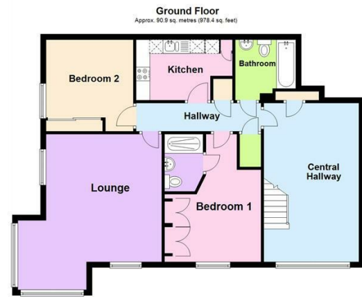
Total area: approx. 90.9 sq. metres (978.4 sq. feet)